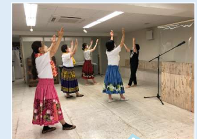
The practice of praise hula